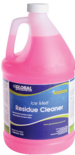
ICE MELT RESIDUE CLEANERS