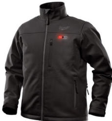
COLD WEATHER PROTECTION