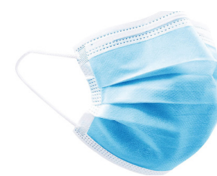
DISPOSABLE FACE MASKS