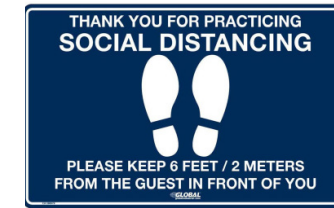
SOCIAL DISTANCING SIGNS