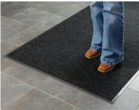
ENTRANCE & FLOOR MATS