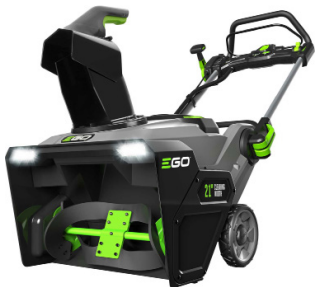
SNOW REMOVAL TOOLS