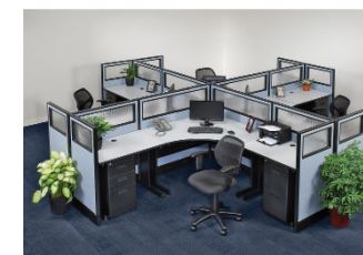
OFFICE PARTITIONS & ROOM DIVIDERS