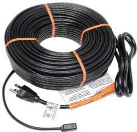
PIPE FREEZE/ROOF & GUTTER DE-ICING