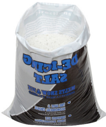
ICE MELT & ROCK SALT