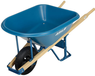
GARDEN CARTS & WHEELBARROWS