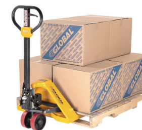
PALLET TRUCKS & JACKS