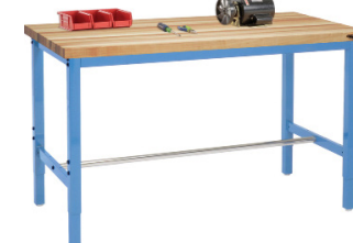
ADJUSTABLE HEIGHT WORKBENCHES