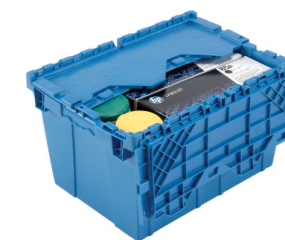
BINS, TOTES, & CONTAINERS