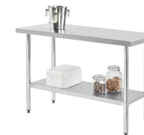
STAINLESS STEEL WORKBENCHES