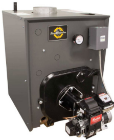
BOILERS, FURNACES, & HYDRONIC ACCESSORIES