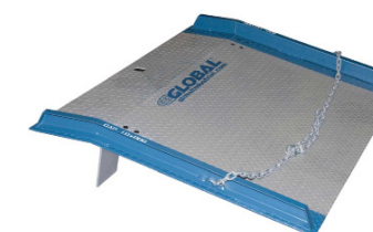
DOCK & TRUCK EQUIPMENT