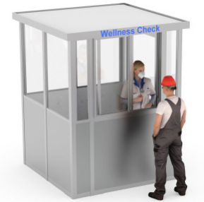
WELLNESS CHECK STATIONS