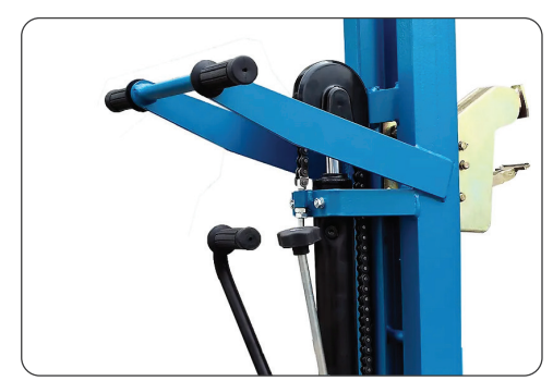
Ergonomic grip handle and height control knob