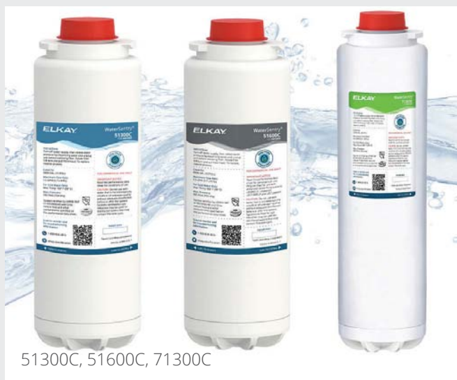
51300C, 51600C, 71300C