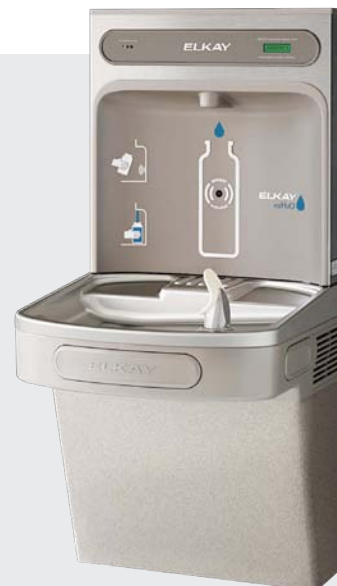
LZWSRK – Retrofit Bottle Filling Station Kit LZS8S – Existing EZ Cooler

Upgrade non-filtered coolers to filtered with the LZWSRK and EWF3000 retrofit products.