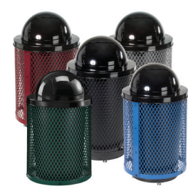
ITEM NO. 261948BKT (Black) 261948BLT (Blue) 261948GYT (Gray) 261948GNT (Green) 261948RDT (Red)