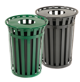
ITEM NO. 237726BKT (Black) 237726GNT (Green)