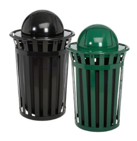
ITEM NO. 261944BKT (Black) 261944GNT (Green)