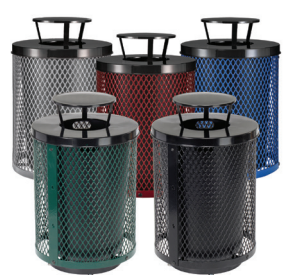
ITEM NO. 261926BKT (Black) 261926BLT (Blue) 261926GYT (Gray) 261926GNT (Green) 261926RDT (Red)