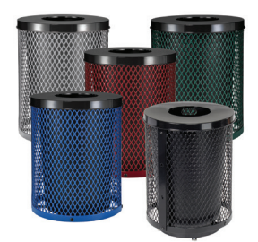
ITEM NO. 261924BKT (Black) 261924BLT (Blue) 261924GYT (Gray) 261924GNT (Green) 261924RDT (Red)