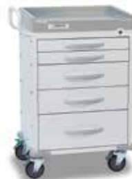
Medical Supply Carts