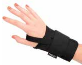
Support & Immobilization