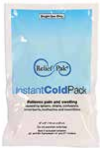
Hot & Cold Therapy