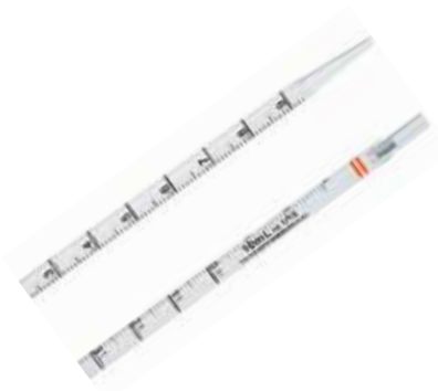
Pipettes & Pipettors