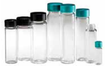
Tubes & Vials