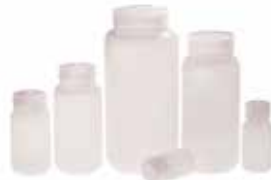
Bottles & Jugs