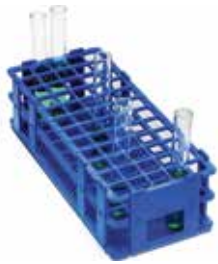
Racks & Stands