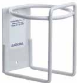
Racks & Shelving