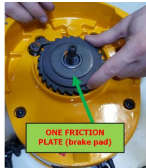
Install Ratchet Disc and Brake Pad