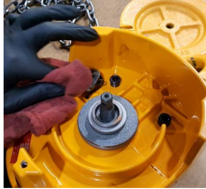
Wiping Cleaner and Rust Inhibitor