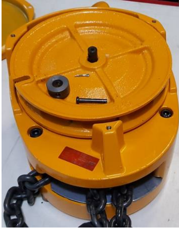
Remove Hand Wheel