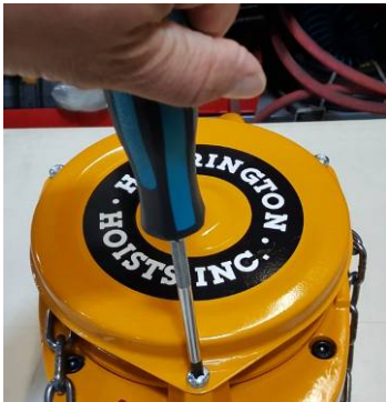
Remove Hand Wheel Cover