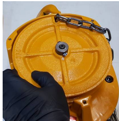
Remove Hand Chain