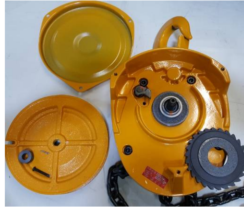
Remove Ratchet Disc and Brake Pad