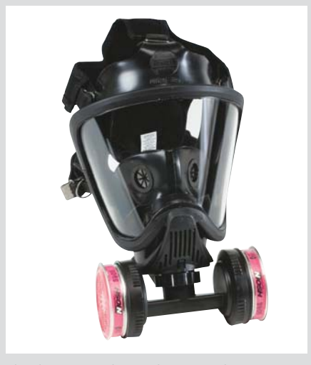
Ultra Elite Facepiece, shown with Twin-Cartridge Adapter and Comfo P100 Cartridges

Note: Ultra Elite and Ultravue Facepieces must be fitted with a Twin-Cartridge Adapter P/N 803622 to be used as a twin-cartridge respirator.