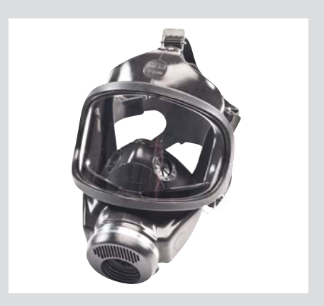
Ultravue Facepiece, shown without Twin-Cartridge Adapter or cartridges