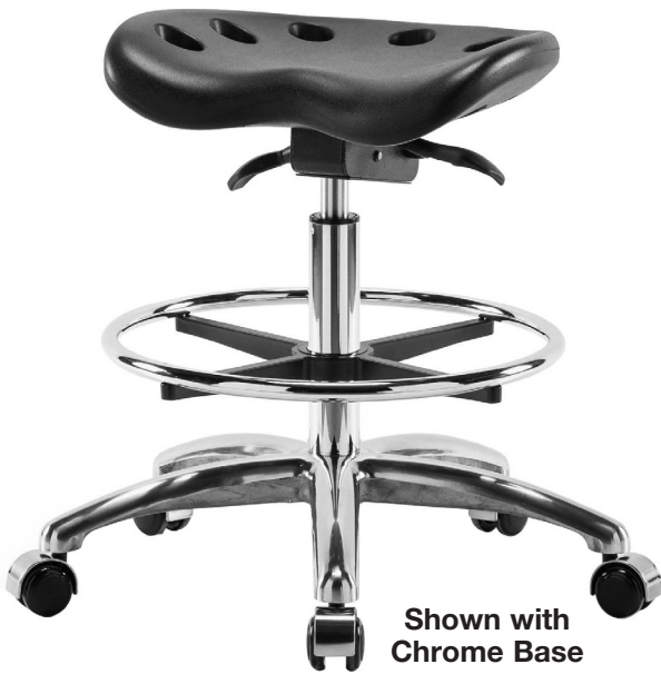
Shown with Chrome Base