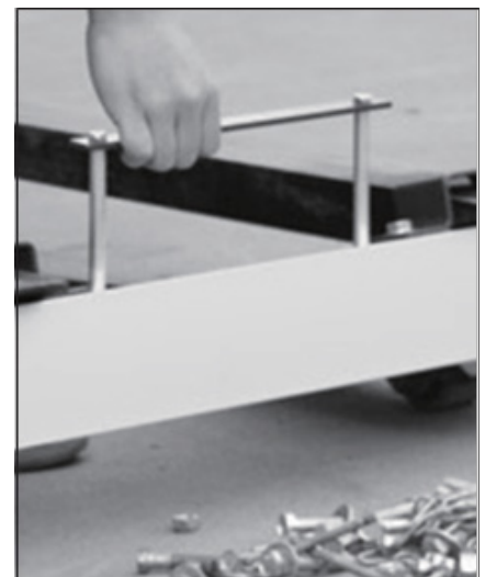
Pull the handle to release the objects