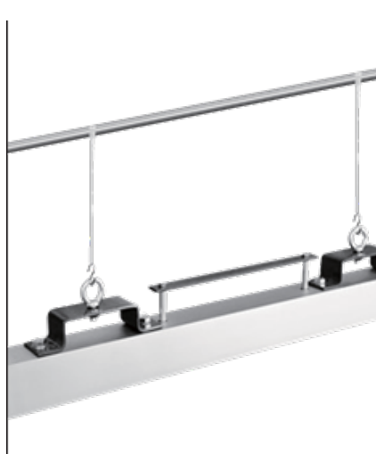
Hang on vehicle with two eye-bolts