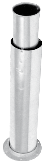
No Loss Stackheads

Nordfab can provide all the components you need for your roasting facility's dust collection system.