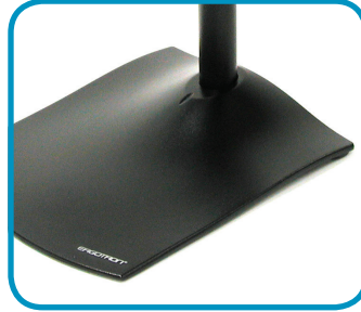
SLEEK, LOW-PROFILE BASE WITH DURABLE FINISH PROVIDES STABILITY AND SAVES SPACE.