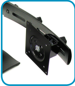
MONITORS CAN BE ALIGNED INTO A SEAMLESS CURVED PROFILE TO BENEFIT VIEWING.