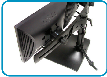
CABLES ARE GUIDED CLEANLY THROUGH CABLE CHANNELS