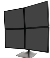
DS100 Quad-Monitor Desk Stand