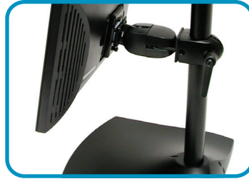
MONITOR HEIGHT CAN BE ADJUSTED ON POLE (33-091-200 SHOWN). 28" POLE (20-137-200) ALSO AVAILABLE, ORDER SEPARATELY.