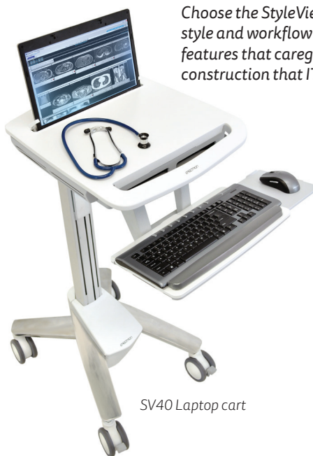
SV40 Laptop cart

Choose the StyleView medical cart that best meets your caregiving needs, style and workflow. Our market-leading StyleView carts include all the features that caregivers ask for, with all the open architecture and quality construction that IT departments require.