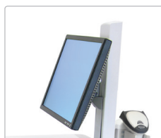
LCD Pivot: #SV40-6300-0