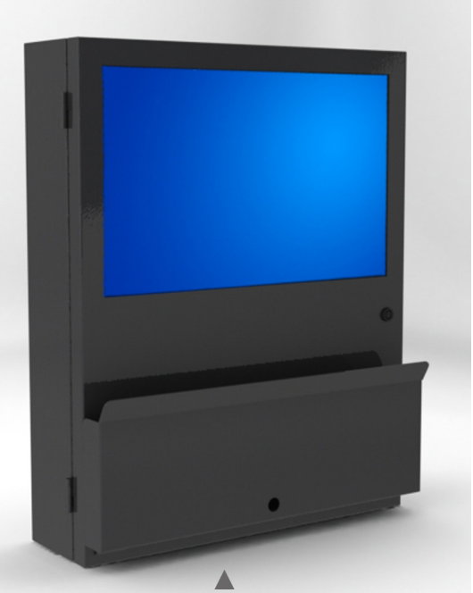
Shown with optional folding keyboard tray. Fixed keyboard tray is standard.