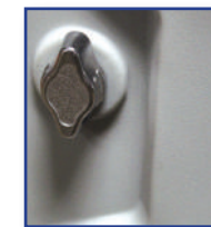
Knob locking mechanism

Sloped XL Series – Our best sloped poly locker with storage capacity designed for larger items and improved latching mechanism: