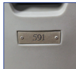
Engraved number doorplate