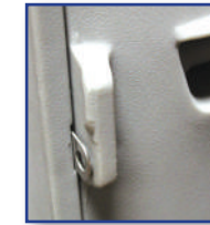
Hasp locking mechanism

Flat Top Series – The most economical alternative to metal: