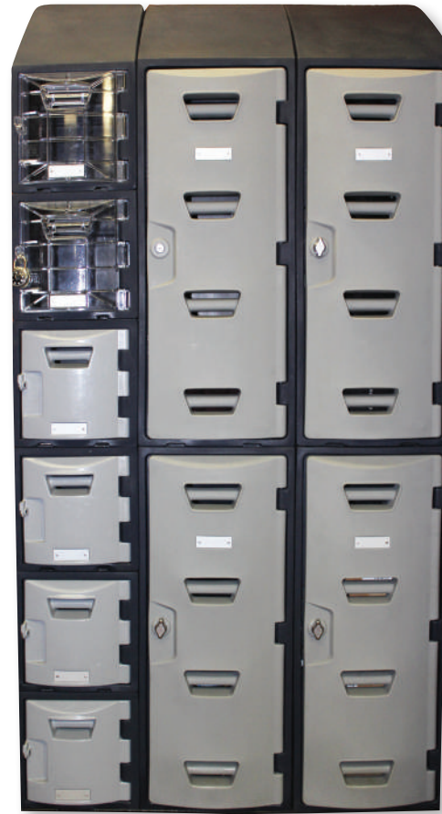
Mix and match sizes and styles to build your own configuration

From there, choose the correct Series and size that meets your need or application.