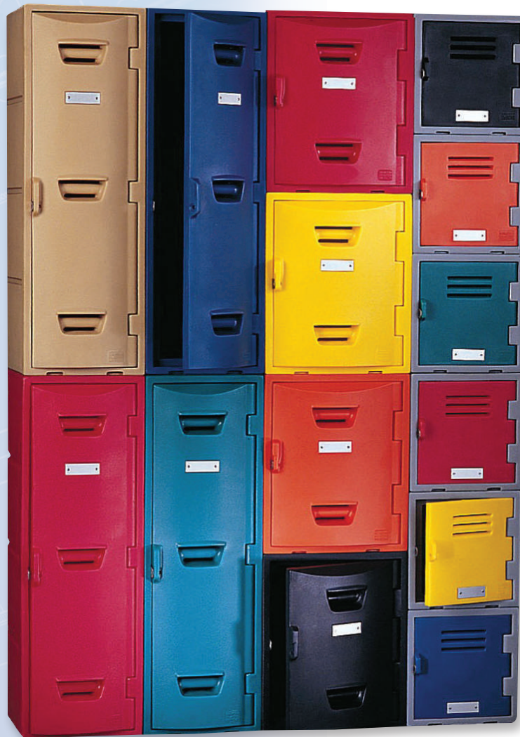
Specify your own color combination