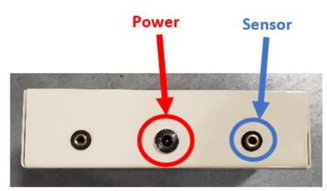
Figure 4 (Top of Control Box)

15. Save these instructions for future reference.