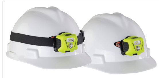
Includes rubber strap and 3M™ Dual Lock™ for strapless mounting to hard hats