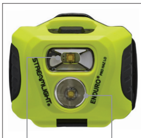
Flood LED Spot LED