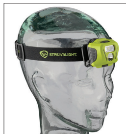
Lightweight, low-profile design