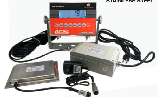
INTRINSICALLY SAFE OPTION