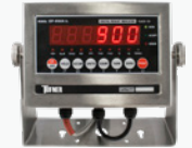
OP-900 STAINLESS STEEL