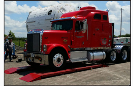
INSTALLED AT NASA, MAY 2015