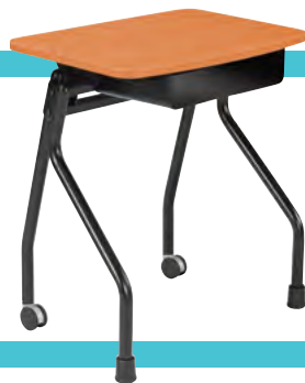
Student FLIP Desk high pressure Pearwood with black base