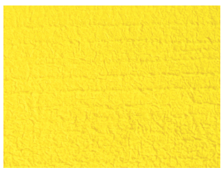
Textured Outsole: Provides grip on both wet and dry surfaces.

Ideal Applications: Food processing, maintenance and service technicians, home repair contractors, plant visitors, paint spray booths, and other general industry applications.