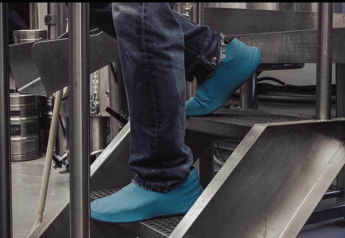
Boot Saver shoe covers are perfect for the color coded world of food processing by helping prevent cross-contamination.