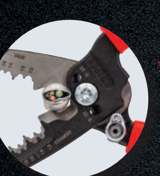
Shear type blades easily cut BX/MC cable