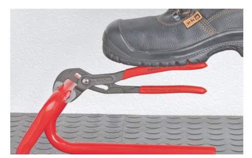
Teeth set against the direction of rotation have a self-locking effect and prevent slipping on the workpiece.