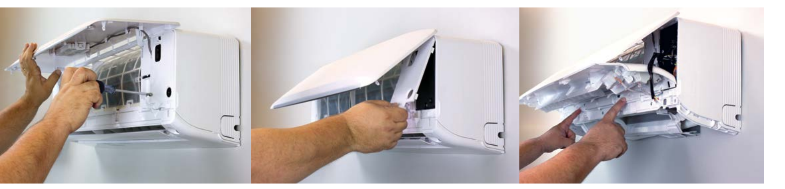
Back out electrical panel screws