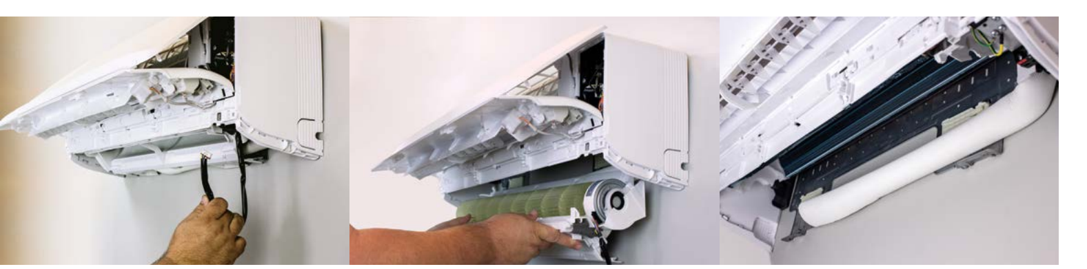
Unplug the wire harness