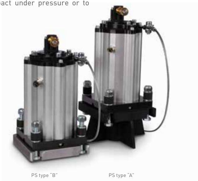
PS type "B"

adhere to the walls, as well as the majority of granular and bulk materials. For this reason the PS series products represent the ideal solution to the problems of formation of bridges and mouse holes.