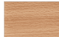
TK - Teak