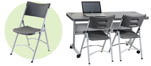
Table top surface smooth to write on

Pair with the Café Time Folding Chair 600 Series MODEL #620