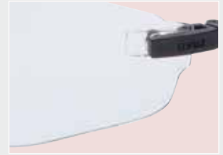
Dual nine-base and "optically perfected" wrap-around lens with integrated side shields provides workers with a clear and unobstructed field of vision.