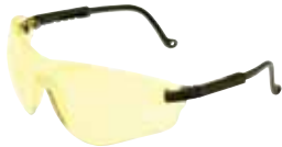
Amber — Ideal for low-light applications where enhanced contrast is needed