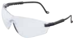
Clear — Ideal for most indoor work applications