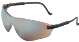
Gold Mirror — Deflects sunlight and glare