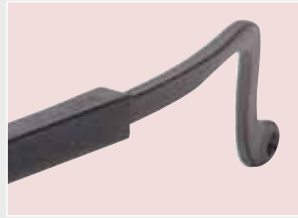
Adjustable temple lengths ensure a proper and comfortable fit.