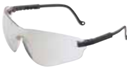
SCT-Reflect 50 — Light mirror coating is ideal for varying light conditions