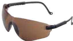
Espresso — Minimizes strong outdoor sunlight and glare