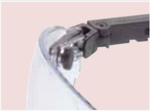
Patented lens inclination system for a customized fit.