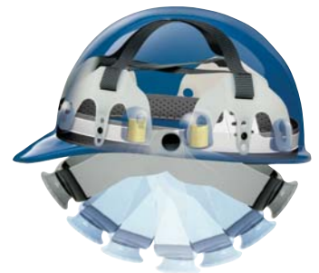
SwingStrap reversible ratchet headgear (replacement MODEL 3SW3 )