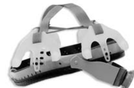
SwingStrap Suspension MODEL 3SW3