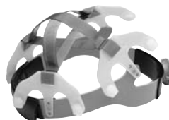
Ratchet Suspension MODEL 3RW3