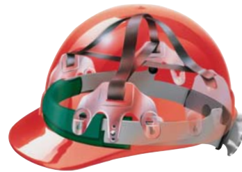
SuperEight suspension with non-slip/non-strip ratchet (replacement MODEL 3RW3 )