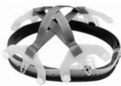
TabLok Suspension MODEL W3F