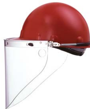
Peak mounted bracket with 4199CL Window MODEL FH66

FM70 (not shown) is for fully dielectric applications.