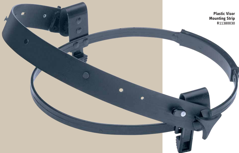
Plastic Visor Mounting Strip #11380030