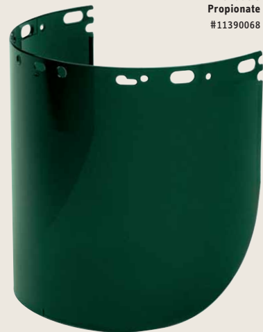
Shade 5 Propionate #11390068