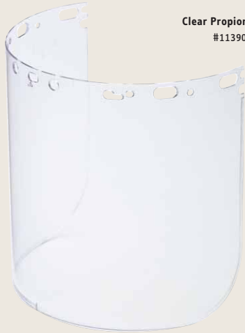
Clear Propionate #11390064