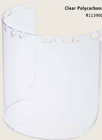
Clear Polycarbonate #11390065