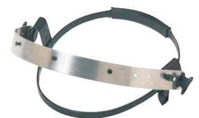
Aluminum Visor Mounting Strip #11380032