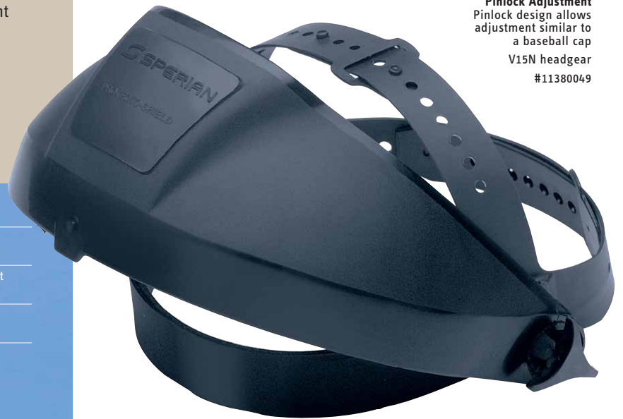
Pinlock Adjustment Pinlock design allows adjustment similar to a baseball cap V15N headgear #11380049