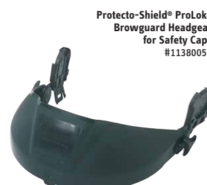
Protecto-Shield® ProLok® Browguard Headgear for Safety Caps #11380057