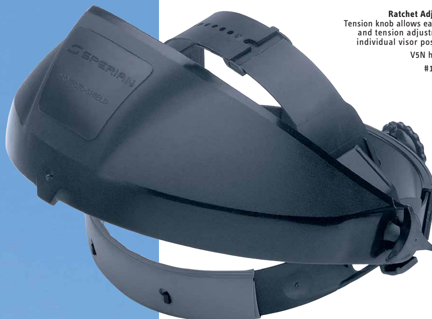
Ratchet Adjustment Tension knob allows easy sizing and tension adjustment for individual visor positioning V5N headgear #11380048