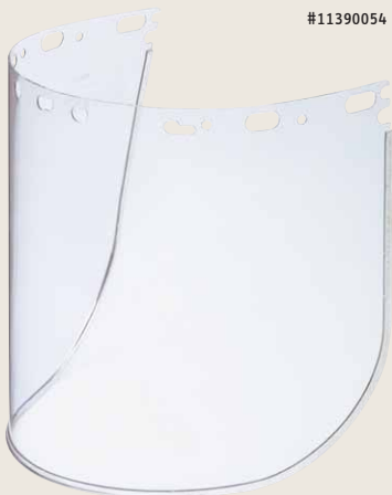
Aluminum Bound Acetate #11390054