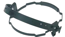
Plastic Visor Mounting Strip #11380031