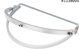
Aluminum Bracket for Full Brim Hard Hat #11380055