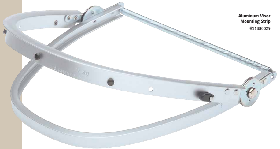
Aluminum Visor Mounting Strip #11380029