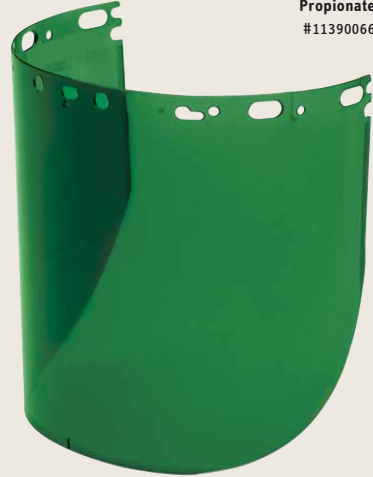
Shade 3 Propionate #11390066