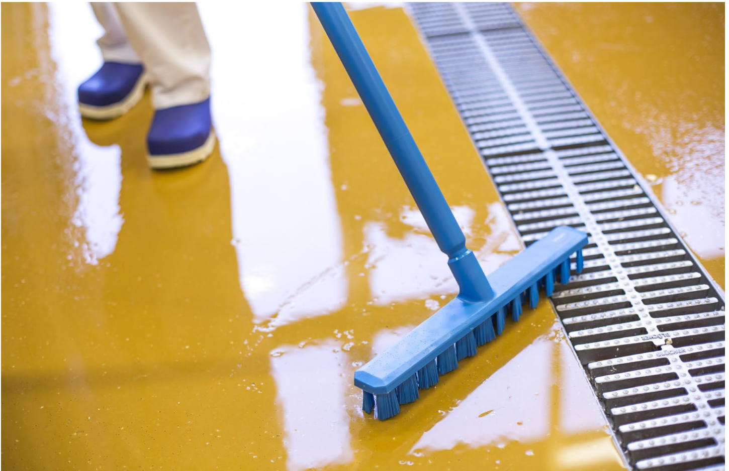
Vikan® High-Low Brush 7047x