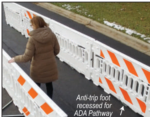
Create ADA Compliant Pedestrian Pathway