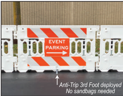
Add Signs for Crowd Control