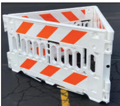
Use Three Units To Create Manhole Guard

Sign Area: Holds 20"W x 14"H Sign on each side (screw on)