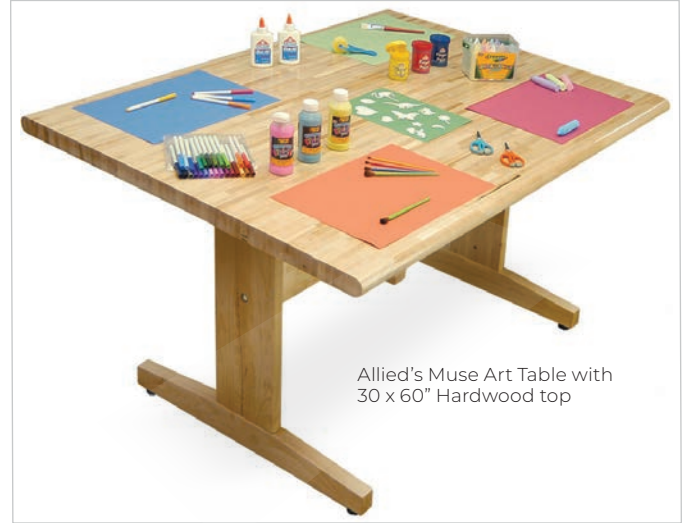
Allied's Muse Art Table with 30 x 60" Hardwood top

Embedded steel anchors secure the top to the frame.