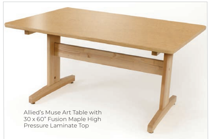
Allied's Muse Art Table with 30 x 60" Fusion Maple High Pressure Laminate Top