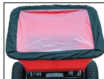
Hopper cover keeps material dry