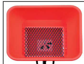
Hopper screen stops clogs