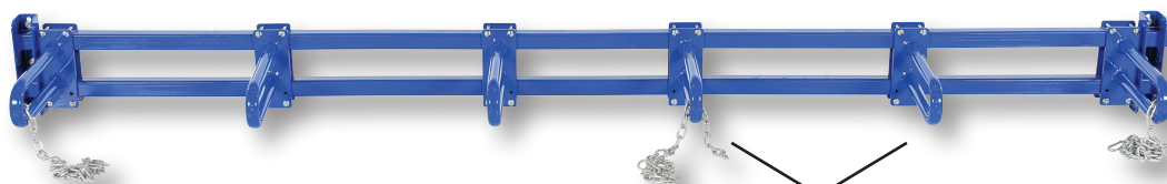
Five Infinitely Adjustable Width Bays