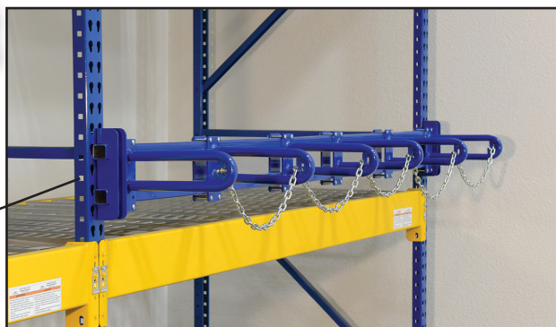
Mounts to Pallet Rack Uprights