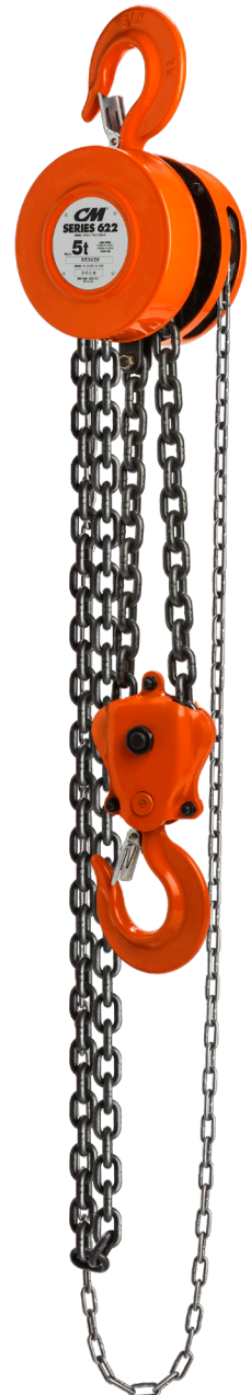
CM SERIES 622 5 TON