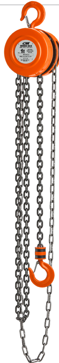
CM SERIES 622 1 TON