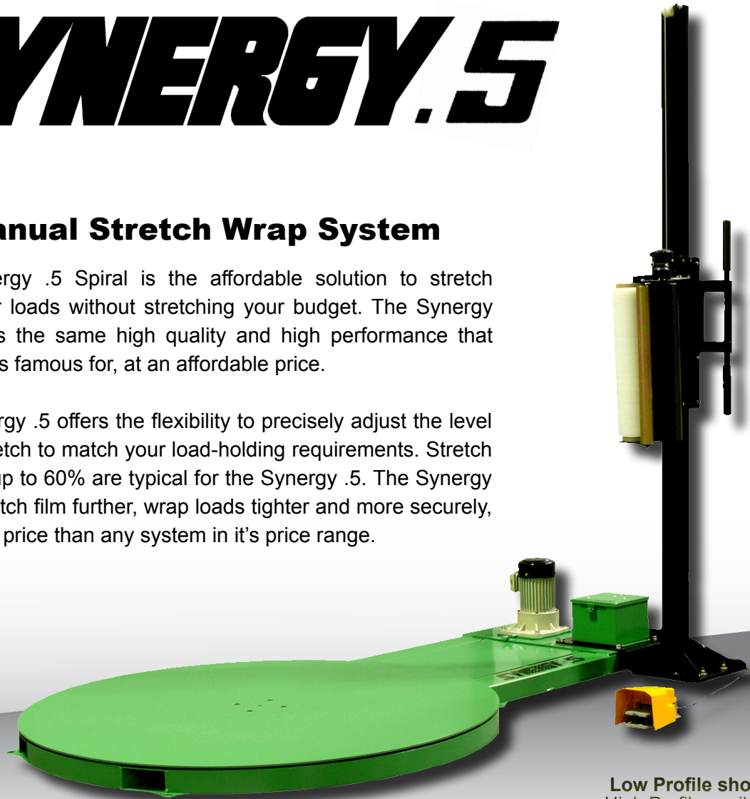
Low Profile shown High Profile available

The Synergy .5 offers the flexibility to precisely adjust the level of film stretch to match your load-holding requirements. Stretch levels of up to 60% are typical for the Synergy .5. The Synergy .5 will stretch film further, wrap loads tighter and more securely, at a lower price than any system in it's price range.