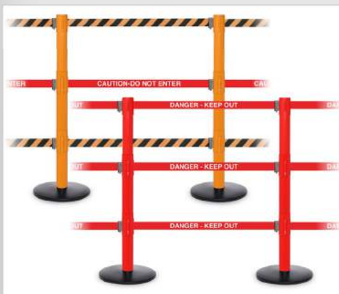
Standard post colors include orange, red, and yellow (above).