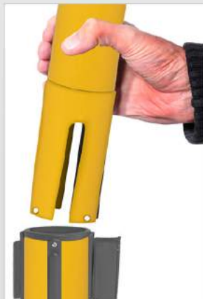
Easy replacement of lower belt cassettes.