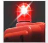
Compact Suitcase Design