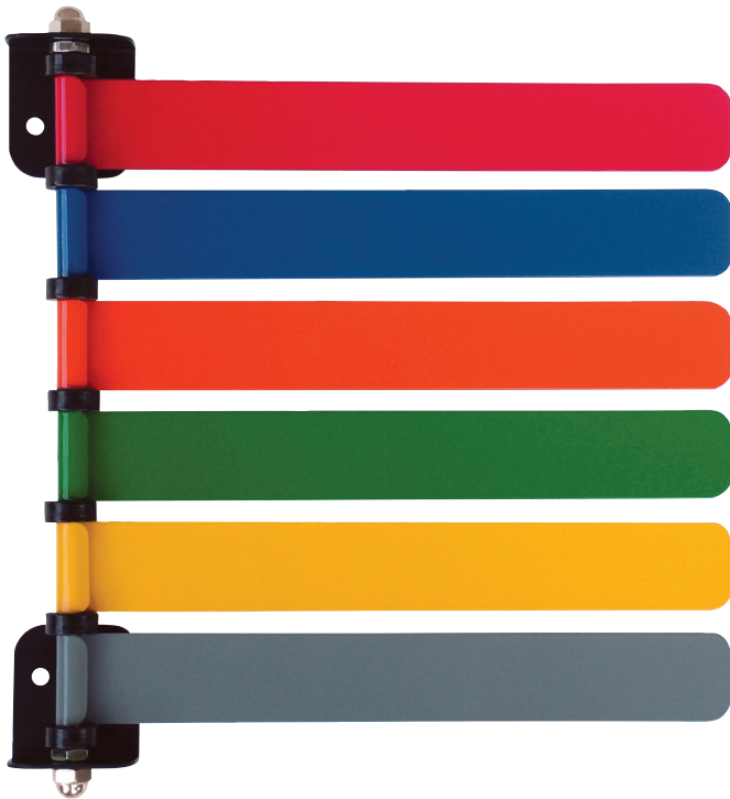
Standard 8" 6 Flag System #291706

Improve business efficiency • Improve employee workplace safety • Improve patient care & management