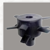
Spiked Auger Aggressive spike pattern tears up clumps