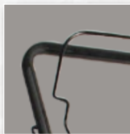
Powder Coated Steel Frame Longlasting durable finish