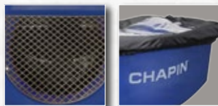
Grate & Rain Cover Included