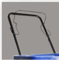
U-Shaped Flip Up Handle Simplified assembly and operation