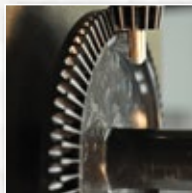
Enclosed Acetel Gears Prevents debris interference