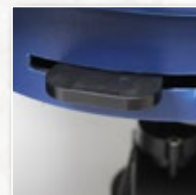
Adjustable Gate Settings For accurate spread settings