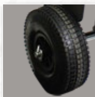
Wide Tread 10" Pneumatic Tires Provide stability over uneven terrain