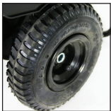
9" Pneumatic Tires Provides traction on snow and ice