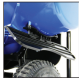
Adjustable Side and Front Baffles For directional control of spread