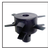
Spiked Auger Aggressive spike pattern tears up clumps