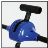
Adjustable Gate Control For accurate spread settings