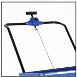
U-Shaped Handle For easy operation