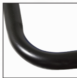
Powder Coated Steel Frame Long-lasting durable finish