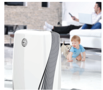
STYLE & FUNCTION