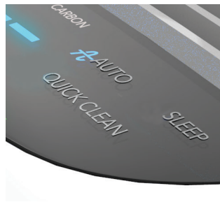
AUTO DUST & ODOR SENSING