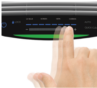
TOUCH AIRFLOW ADJUSTMENT