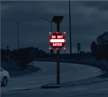
PERPENDICULAR OR OFFSET ANGLES