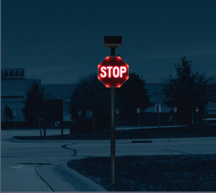
LOW AMBIENT LIGHT CONDITIONS