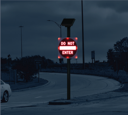
PERPENDICULAR OR OFFSET ANGLE