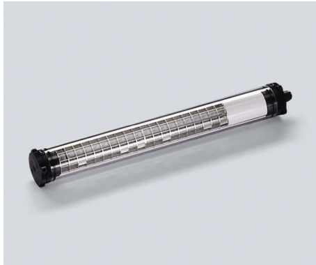
RL70CE- 124 H