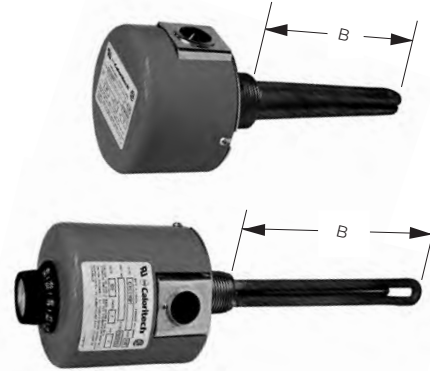
Table 1 – Screwplug Heaters (One Element) - 1" NPT