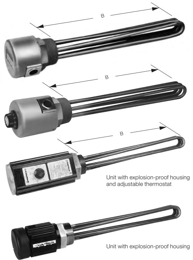
Table 3 – Screwplug Heaters (Two Elements) - 2" NPT