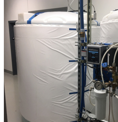
Ideal process cooling solution and Plastics