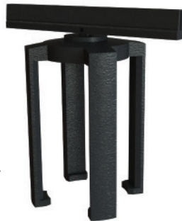
PLUS BARRIER SYSTEM SIGN BRACKET