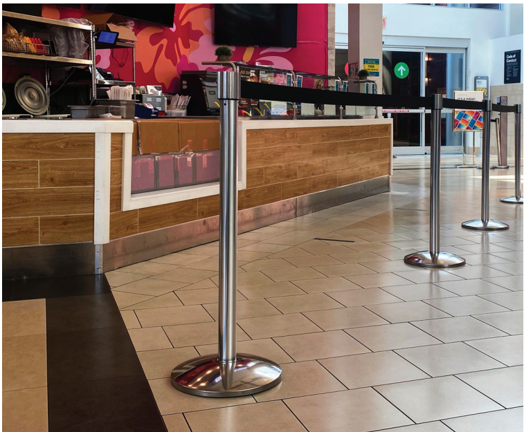
SINGLE BELT OPTION