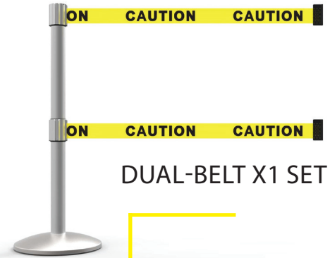
DUAL-BELT X1 SET