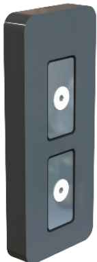
MAGNETIC ATTACHMENT FOR PLUS BANNER HEAD