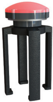
PLUS BARRIER SYSTEM LIGHT KIT