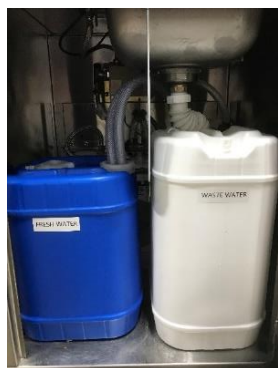
Internal Cabinet View

Clean and Care Manual (PDF) Installation Instructions (PDF) Warranty (PDF)