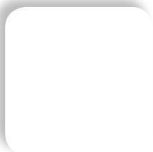
PURE WHITE T94