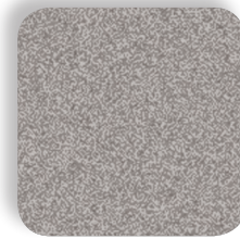
GREY NEBULA 4622-60