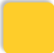
SAFETY YELLOW T93

The paint samples shown are for representation purposes only and are not a true match. Contact our Customer Service Department if actual samples are required.