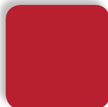
INDUSTRIAL RED T27