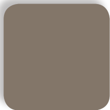
TAN METALLIC T56