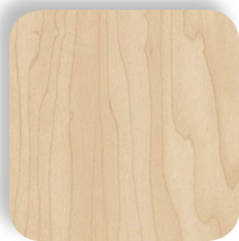
MANITOBA MAPLE 7911-60