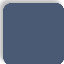
TECH BLUE T42