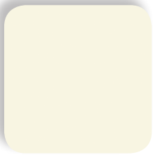
WHITE SAND D403-60