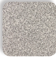
WHITE NEBULA 4621-60