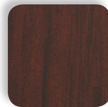
FIGURED MAHOGANY 7040K-78

Additional melamine and laminate options are available on the Wilsonart website . Please contact our Customer Service Department for pricing and lead time.