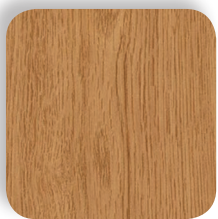
SOLAR OAK 7816-60