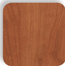
WILD CHERRY 7054-60