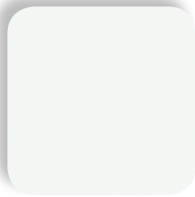
FROSTY WHITE 1573-60